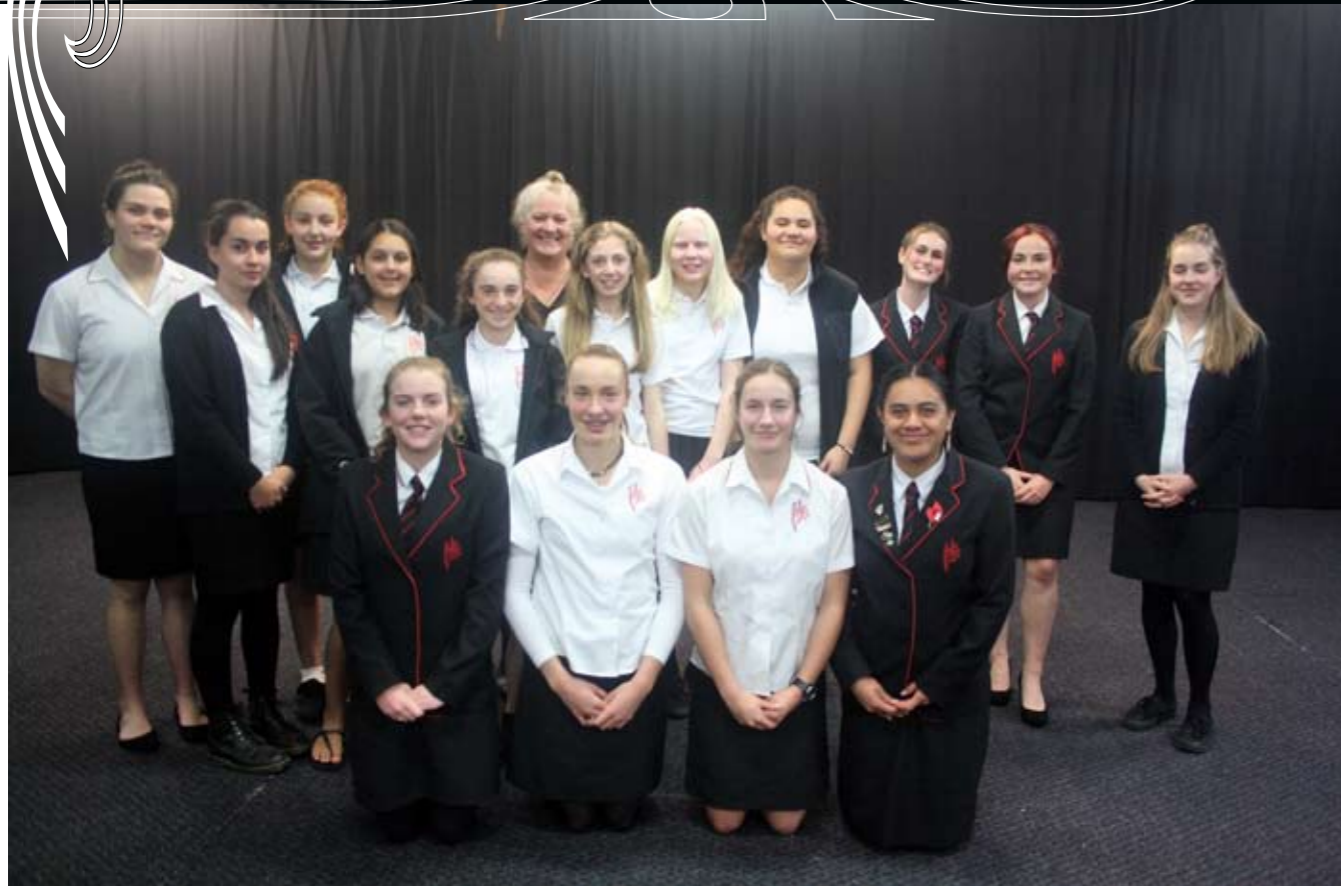
A GLORIOUS NIGHT OF SPEECH