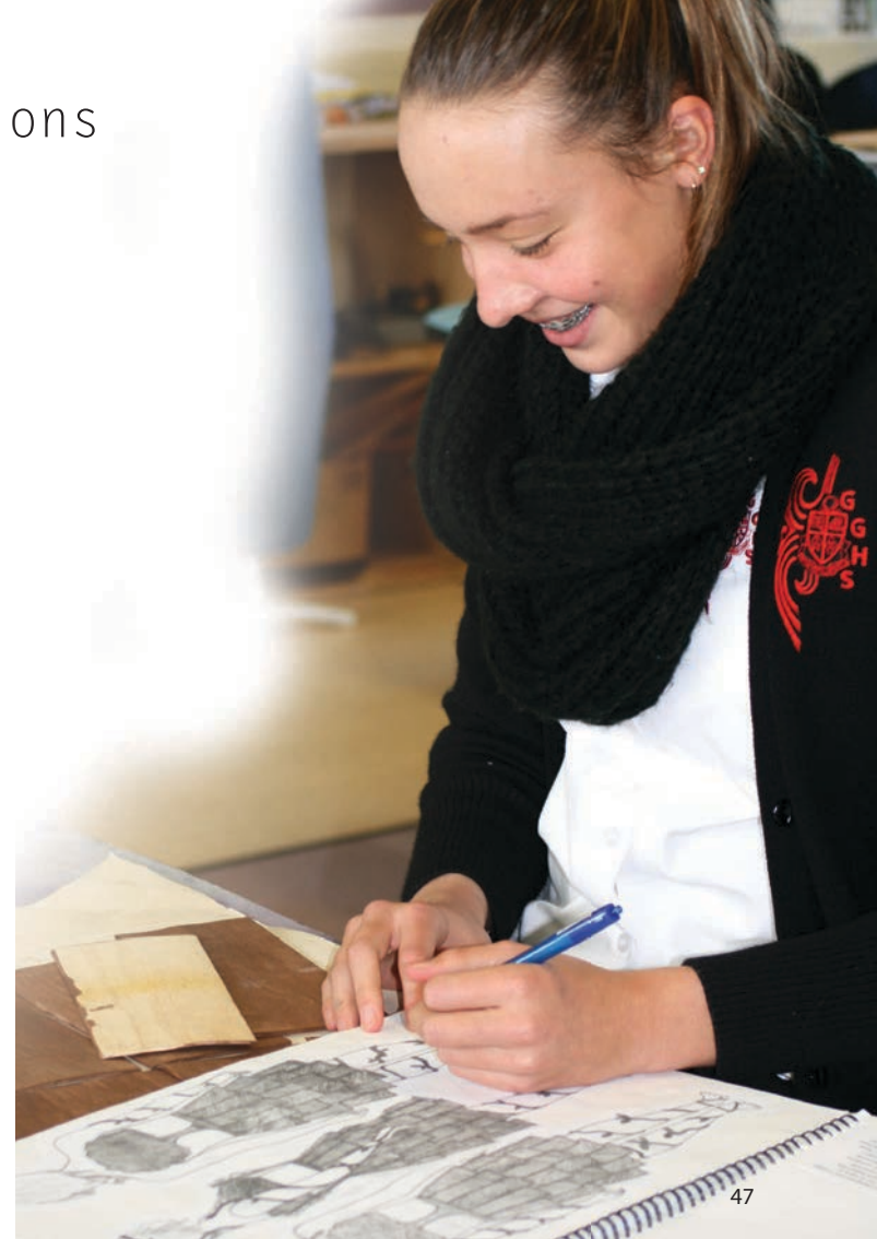
Back cover: Yr 10 Art History Paintings