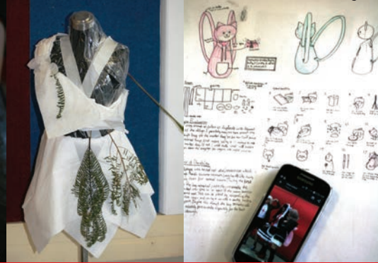
Product Design and Digital Technologies