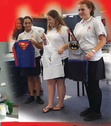
Textiles Technology Food Technology