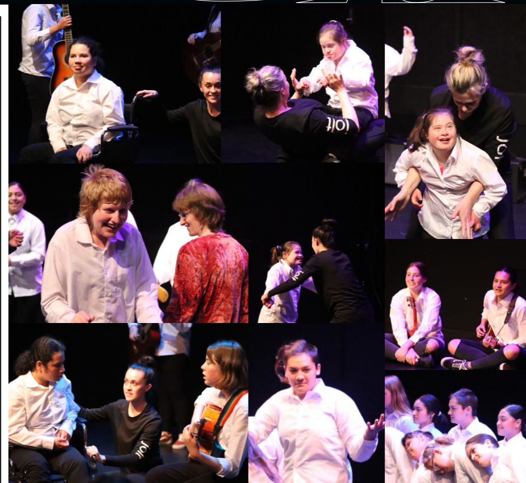
Jolt Dance, Christchurch Symphony Orchestra and Gisborne Girls' High School Music, Dance and Learning Support students performed at the Lawson Field Theatre as part of the Arts Festival.