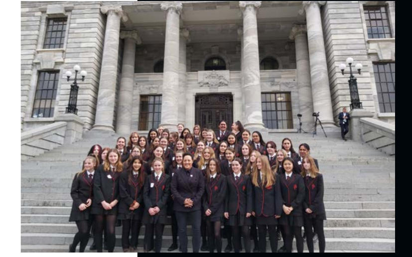
Our students exploring study options at the EIT Careers Expo