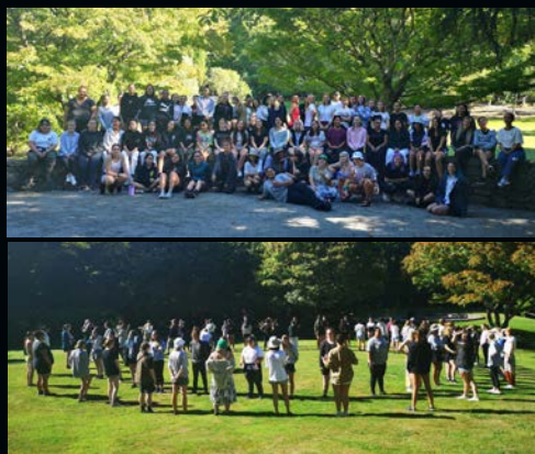
Year 13 day at Eastwood Hill